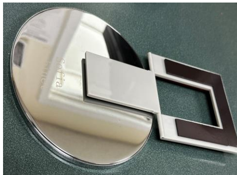
REAR VIEW (HINGE IN OPEN POSITION)