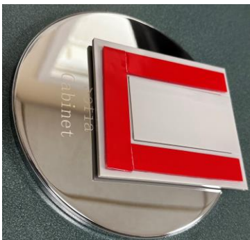
REAR VIEW (HINGE IN CLOSED POSITION)